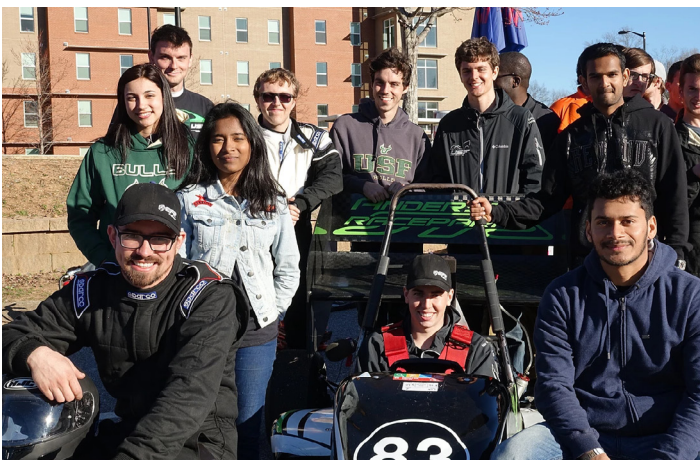
Our Team at Formula South Invitational

Most importantly, we received valuable experience applicable to our May 10th competition. Formula SAE Michigan is twice as intense, twice as far away and takes more than twice the preparation. We will be ready once we have a car!