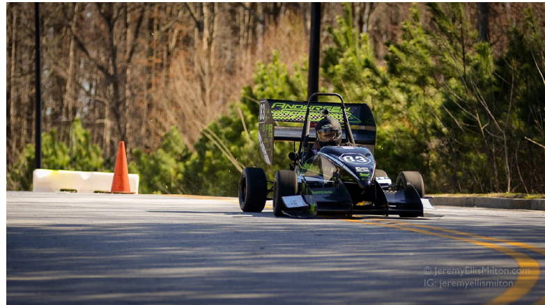
Max driving on straight #2

FSI consisted purely of dynamic events (all driving). There was skid pad, acceleration and a time trial event, very similar to a regular FSAE competition. What was different was the time trial event which was a combination of an autocross and endurance all in one. The time trial event used a circuit with the fastest lap considered for the autocross score. There was one driver change and one stint per driver.