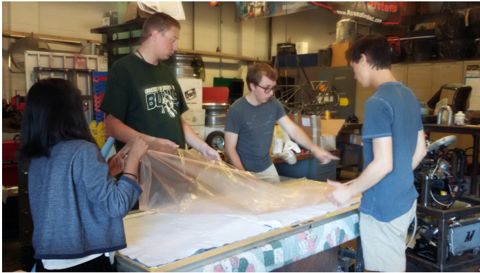
Composites team laying up Carbon Endplates - Wet layup

and ≈14 days till unveiling on April 23rd