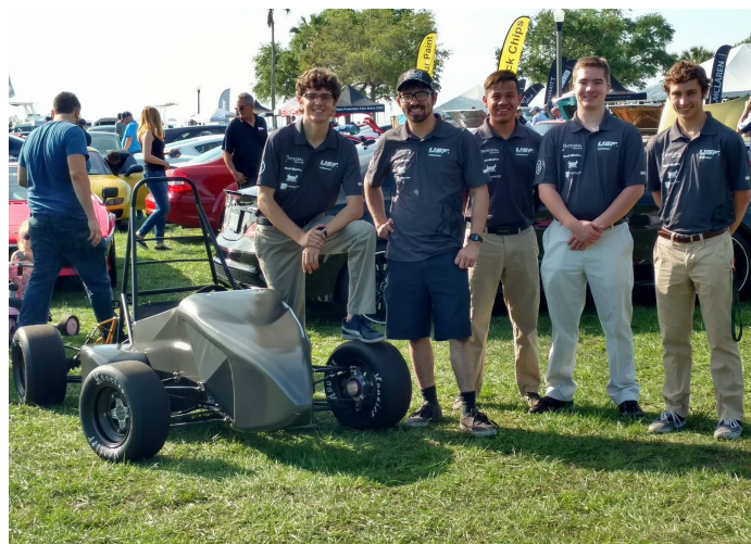
F2017 car as of April 6th

F2017 is in the making! This photo below depicts evidence of our all new car taken to the Festivals of Speed on April 6th. It has come a long way and it still has a lot left to get done before our official unveiling date.